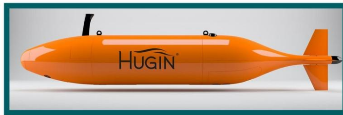
Image is an example of the AUV to be used; the unit will be in the Hugin class.

Canopy Offshore Wind Farm plans to begin High Resolution Geophysical surveys of lease area P-0561, inshore notional investigative routes in federal waters, and associated 500-meter buffers on or around June 20, 2024 through September 30, 2024. This is the initial survey campaign focused on characterizing the seabed, refining knowledge of bottom features or obstructions, and locating areas of archeological interest. Survey work will be acquired with an untowed, autonomous underwater vehicle (AUV) and will include multibeam bathymetry, side scan imaging, magnetic measurements, sub-bottom profiling, and photography. All work will comply with federal requirements from the Bureau of Ocean Energy Management and will use equipment that meets California low energy equipment requirements.